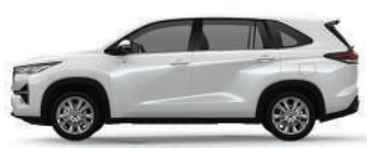
Platinum White Pearl Mica