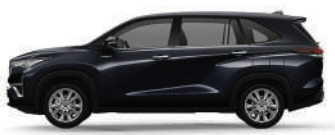
Dark Steel Mica