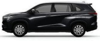
Attitude Black Mica