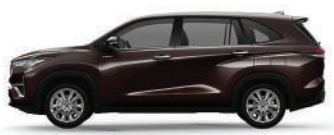
Blackish Brown Mica